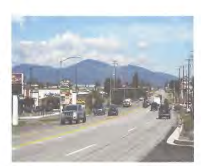
Highway 41 project comes into focus

New signals are planned to be installed at Lancaster in Rathdrum and 16th Avenue in Post Falls in 2020. A bike-pedestrian trail on the